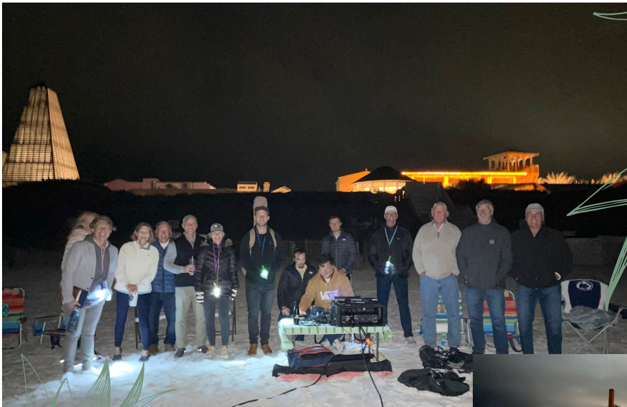
Sunrise set-up crew