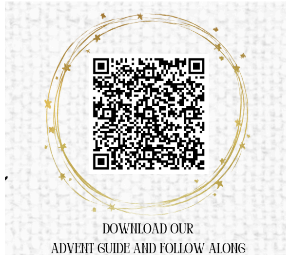
DOWNLOAD OUR ADVENT GUIDE AND FOLLOW ALONG