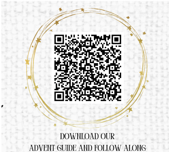
DOWNLOAD OUR ADVENT GUIDE AND FOLLOW ALONG

Next week, Dec 1 kicks off Advent. Join us in journeying to become more like Jesus in this season by reading along with us through our 2024 Advent Guide. Pick one up today here at The Chapel, or you can download a digital copy.